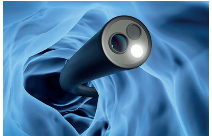
Medical: Endoscopes, X-ray Cameras, Optical Isolation