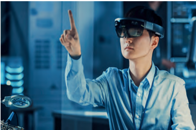
XR: VR, AR External Cables and Embedded Interconnects

In 2023, Silicon Line is sampling its 10 Gbps MIPI D-PHY serdes IC targeting ultra high resolution 4K60 camera external and embedded link interconnects for medical, XR, video conferencing, and drone applications.