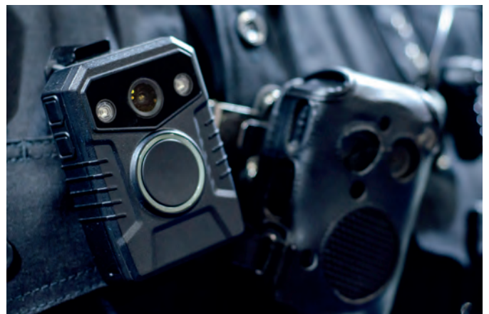
Security Cameras: Body-Worn, Surveillance, Night Vision