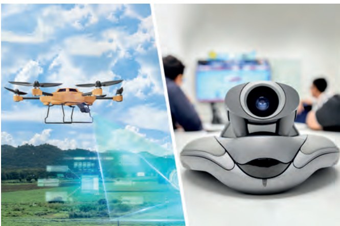
Professional: Video Conferencing, Drones